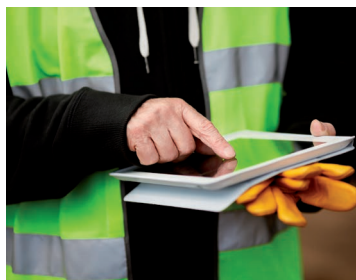
BSG's Safety Advisers conduct regular inspections for multiple sites throughout the UK. Digital inspection reports are sent electronically to our members' offices.

Each BSG site visit generates an electronic inspection report which is transmitted to our members' offices, usually within the hour and brings any areas of concern or material breaches to their attention.